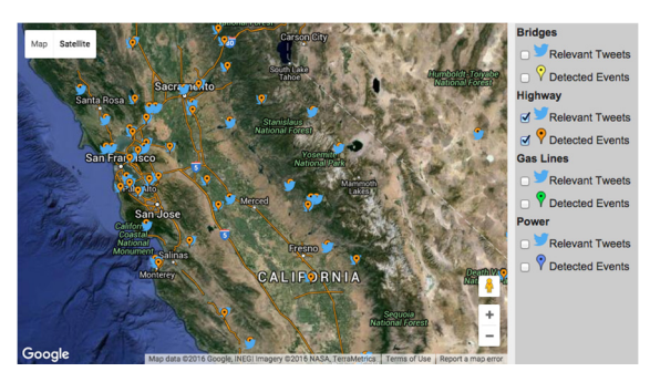
Figure 3: Relevant tweets and detected highway damage events; example for California, USA.

Area, as well as in more sparsely populated rural areas, e.g., events near Lone Mountain and Death Valley. In addition, these results include a highway damage event due to a flood and subsequent mudslide, showing the ability of the approach to detect damage events due to multiple hazards.