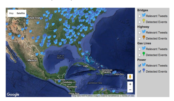
Figure 4: Relevant tweets and detected power infrastructure damage events; example for the United States and Caribbean.

For gas line damage, there were no particular events of interest, so a map is not shown here. Maps can, in general, be generated for locations or events of interest. Power infrastructure damage events are shown in Figure 4, which illustrates the widespread nature of power failures. An example of relevant tweets and detected events in the United States and Caribbean are shown. In addition to the outage events detected across the United States, we see the major power outage detected in Puerto Rico from the October 23, 2015, event.